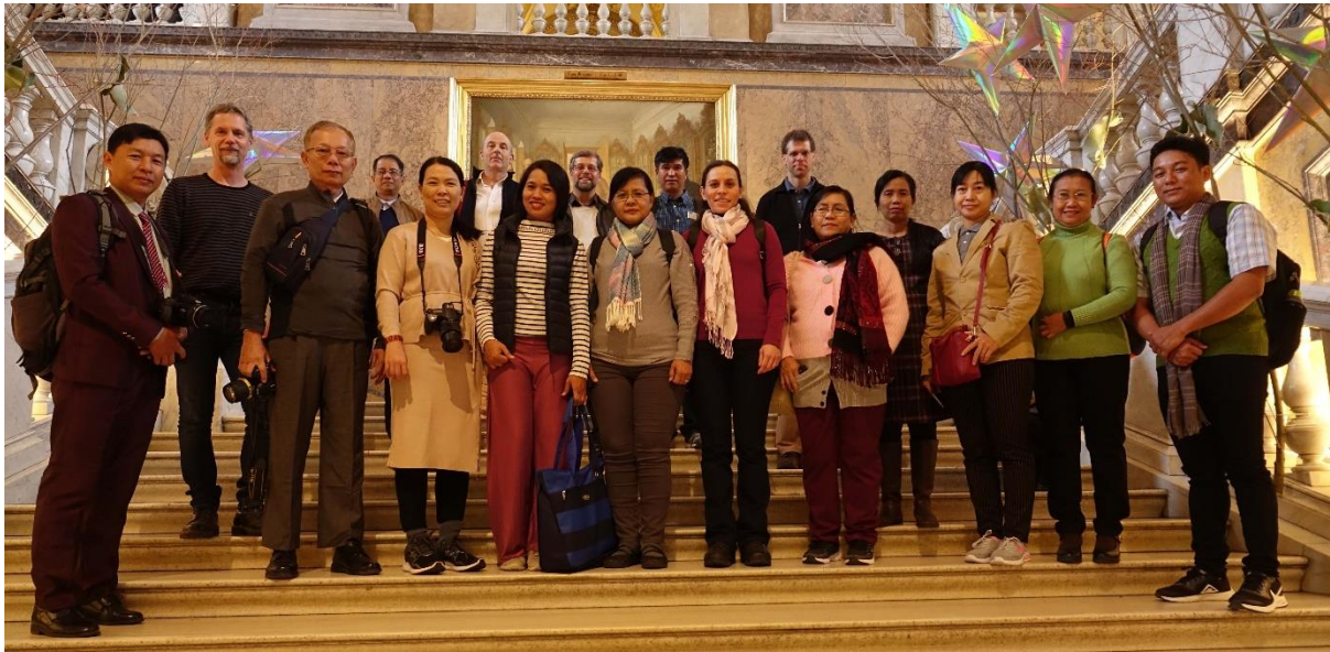
Figure 7. Study visit of Steering Committee and Associate members to the Natural History Museum, Vienna.

The visitors were shown the extensive collections of birds exhibited to the public and the scientific collections, which are maintained for the benefit of the scientific community. The Museum has the