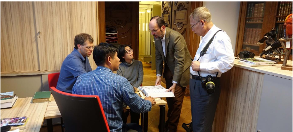
Figure 10. Further more detailed discussions about possible future collaboration.