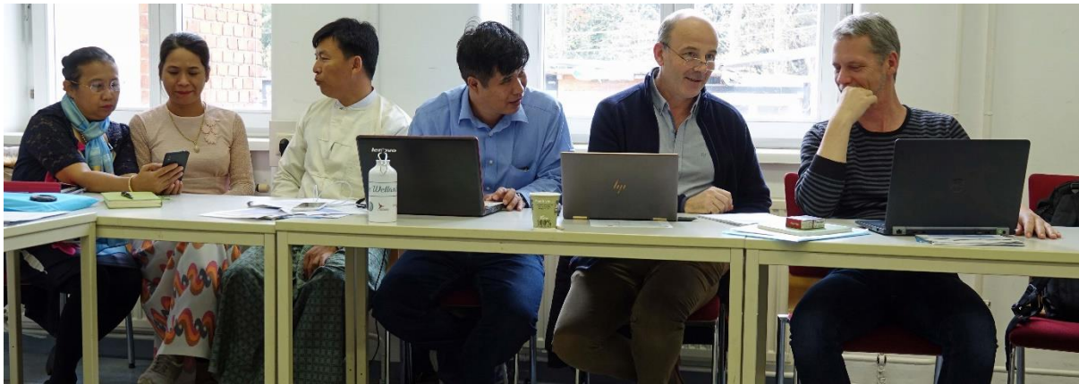
Figure 5. Members of the European and Myanmar teams in discussion during the Steering Committee.